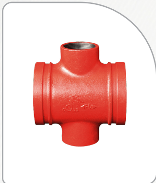
Cross Mechanical Tee