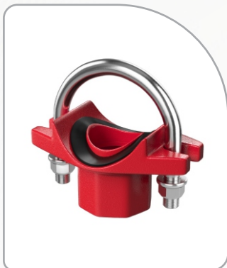
Small Mechanical Tee