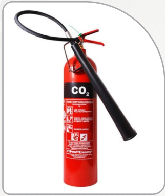
Co2 Type Fire Extinguisher