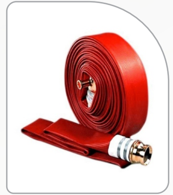
RRL Hose Pipe