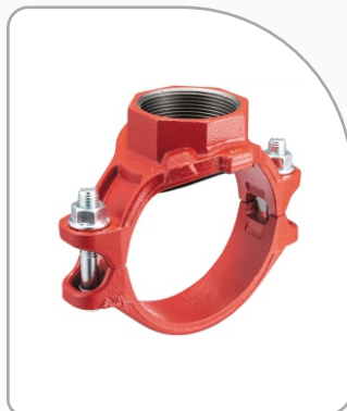
Threaded Mechanical Tee