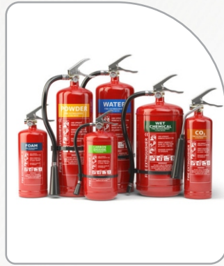
ABC Type Fire Extinguisher