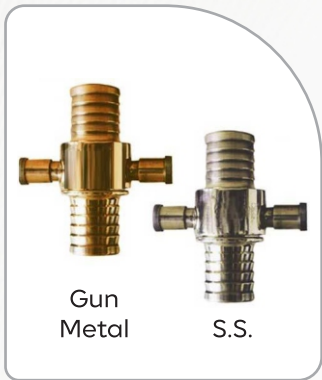
Male Female Coupling